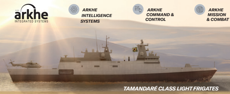
TAMANDARÉ CLASS LIGHT FRIGATES